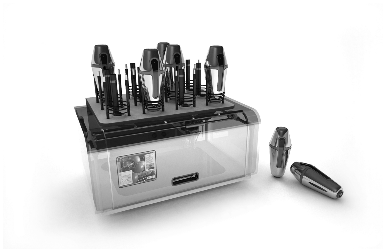
Fig. 4. The Digital Fabricator and its ingredient containers.

of sugar, flour, butter and chocolate in chocolate-chip cookies, the user can pre-program the Virtuoso Mixer to simultaneously cook all the recipes. This carousel architecture creates an efficient way to test multiple recipe variations that can generate fundamentally distinctive eating experiences while presenting subtle differences in composition.