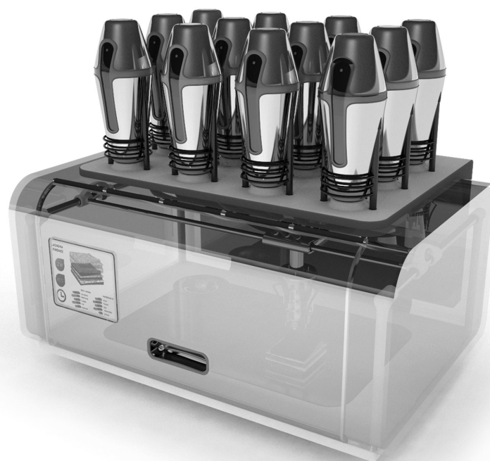
Fig. 3. The food-modeling machine—the Digital Fabricator.

The machine's interface is designed to allow users to easily and rapidly experiment with different material combinations. As ingredients move from the top to lower layers, they can be combined in precisely controlled amounts, crushed and mixed to different degrees, and eventually extruded to compile samples made of discrete layers with varying thicknesses. The large range of possible combinations allows users to quickly design, assemble and evaluate (by tasting) several ingredient combinations. The final "recipes" can eventually be saved, shared with other machines or users or simply retrieved by the same machine for the preparation of a meal. For example, in order to explore different quantities