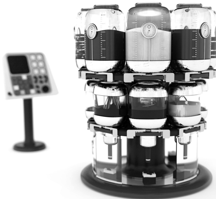
Fig. 2. The ingredients-combination machine—The Virtuoso Mixer.

Computer-controlled machines have started a new revolution in design, allowing designers to manipulate forms and materials with increased and previously unimaginable capability and efficiency. This versatility, applied to cooking, can enable users to develop new flavors, textures, scents and shapes to create entirely new eating experiences that would be difficult to achieve through traditional cooking methods. For example, using traditional methods, it would be impossible to create lasagna dough in a variety of new forms and designs or to apply scientific principles to radically recon-